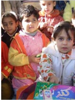
Children in a Gaza refugee camp receiving food and school supplies through a recent Jerusalem Fund grant.

THE PALESTINE CENTER and its educational program give voice to the Palestinian narrative through policy briefings, lecture series, conferences, symposia, scholarly research publications, and an extensive research library. The Center's analysis emphasizes a Palestinian perspective on the peace process, the Right of Return and final status negotiations, elections, international law, media coverage of Israel and Palestine, and U.S. foreign policy in the region.